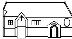
St Michael's, Woolmer Green